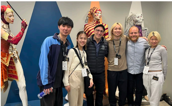
At the international headquarters of Cirque du Soleil

Participants toured La TOHU, North America's only theater specializing in contemporary circus, and the international headquarters of Cirque du Soleil. Located within the Cité des arts du cirque, a complex dedicated to contemporary circus arts in the revitalized Saint-Michel area, the visit provided insights into the complete cycle of contemporary circus, from education and training to production and distribution. Participants learned about Montreal's role as a center for creativity, innovation, and employment within the circus arts.