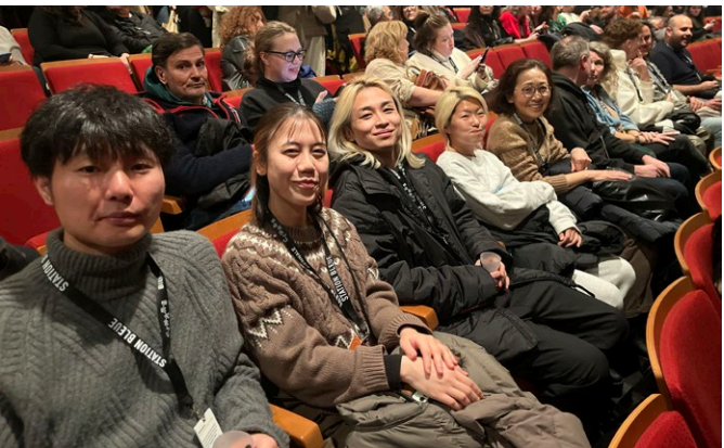
At the opening show "SLAM!" venue