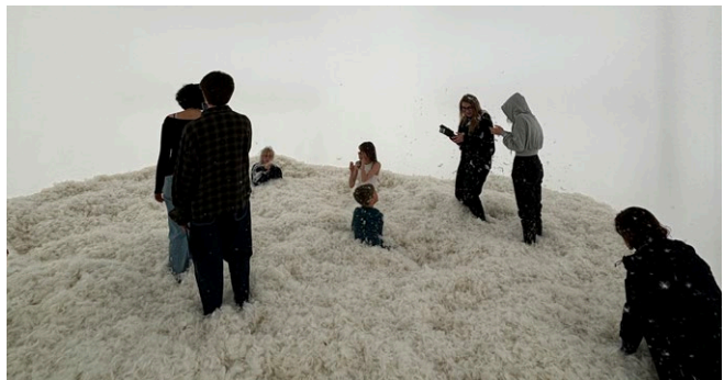
MAXXI (National Museum of 21st Century Arts)