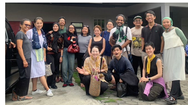
At Teater Garasi in Yogyakarta